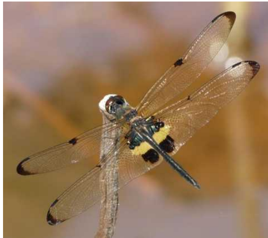
Size: 39–41 mm