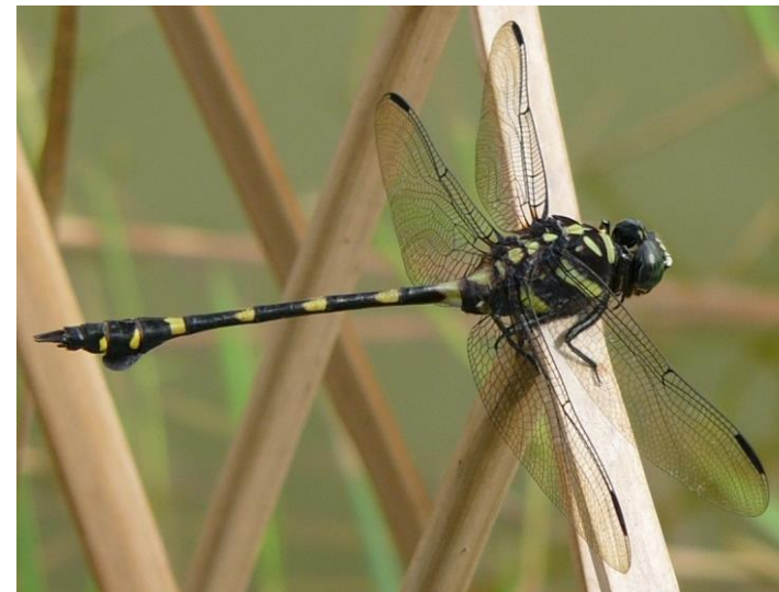
Size: 64–68 mm