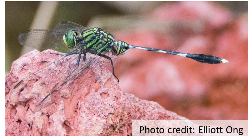
Size: 47–52 mm