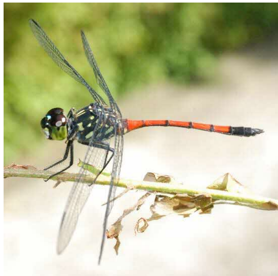
Size: 37–41 mm