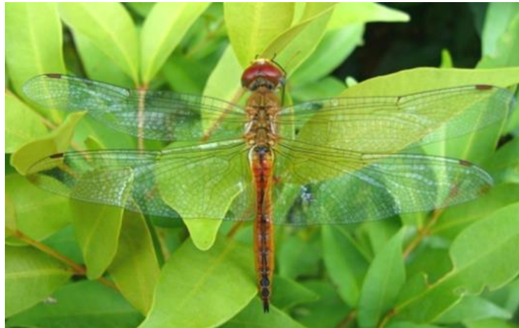
Size: 45–47 mm